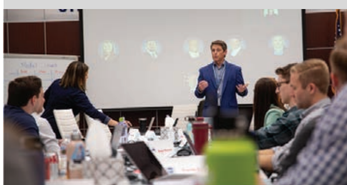
1:1 mentorships with SNC leaders and meet and greets with senior executives.