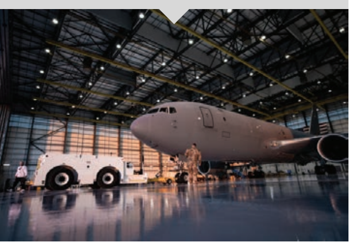
10-12 week paid internship in a variety of technical and operational areas of the business.