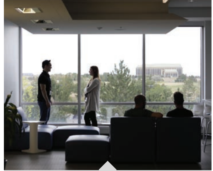
On average, over 75% of our interns convert to full-time employees .

Each intern receives mobility assistance based on how far they move from home to intern with SNC.