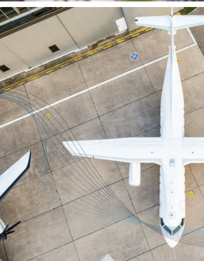
25-time consecutive FAA Diamond Award winner.